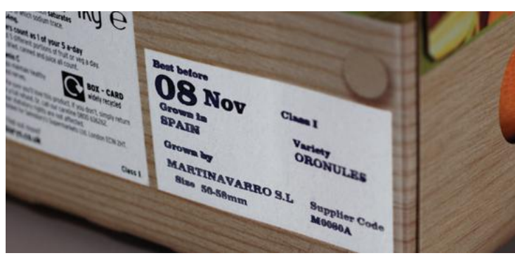
* Features available when using genuine ICE TIJ ink cartridges.