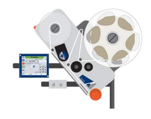
ICE Vulcan Print & Apply Labeller