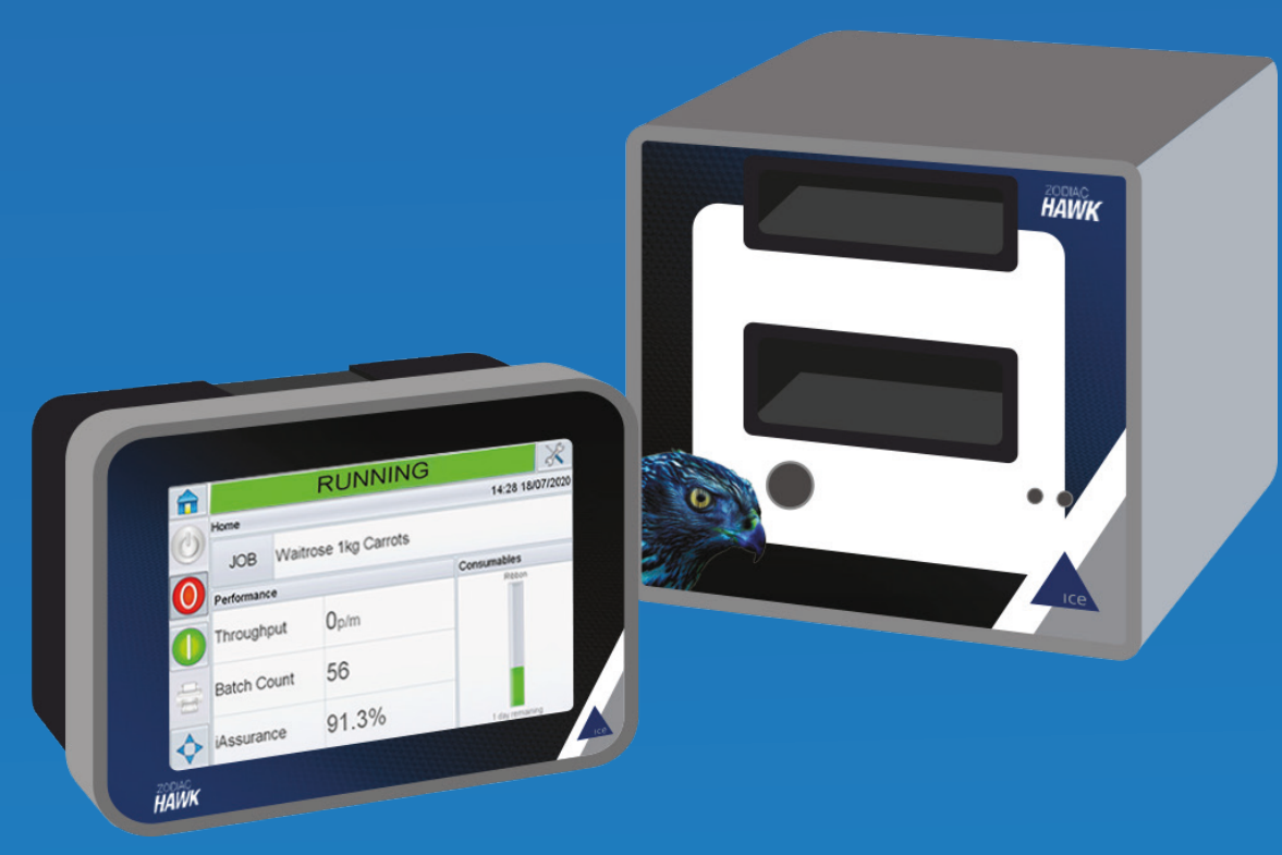
Thermal Transfer Overprinting